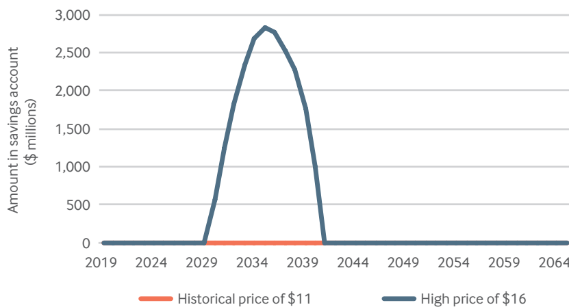
Figure 3. Projected funds in the Revenue Saving Account across different LNG price scenarios

Revenues are not expected to reach the 3 percent of GDP threshold at which they are required to be deposited into the Oil and Gas Fund’s Revenue Saving Account. They will therefore only finance the national budget. Savings are only likely if the price reaches at least $15-16. Even then, they would still be relatively small, and drawn down quickly once revenues fell from their peak. However, unless circumstances change significantly, we do not believe this necessitates lowering the savings threshold. A common policy-making mistake is to save a significant proportion of resource revenues while simultaneously borrowing. A growing number of countries are setting up sovereign wealth funds into which they place revenues that earn low interest, despite also having large debts that they have to pay much higher interest on. 13